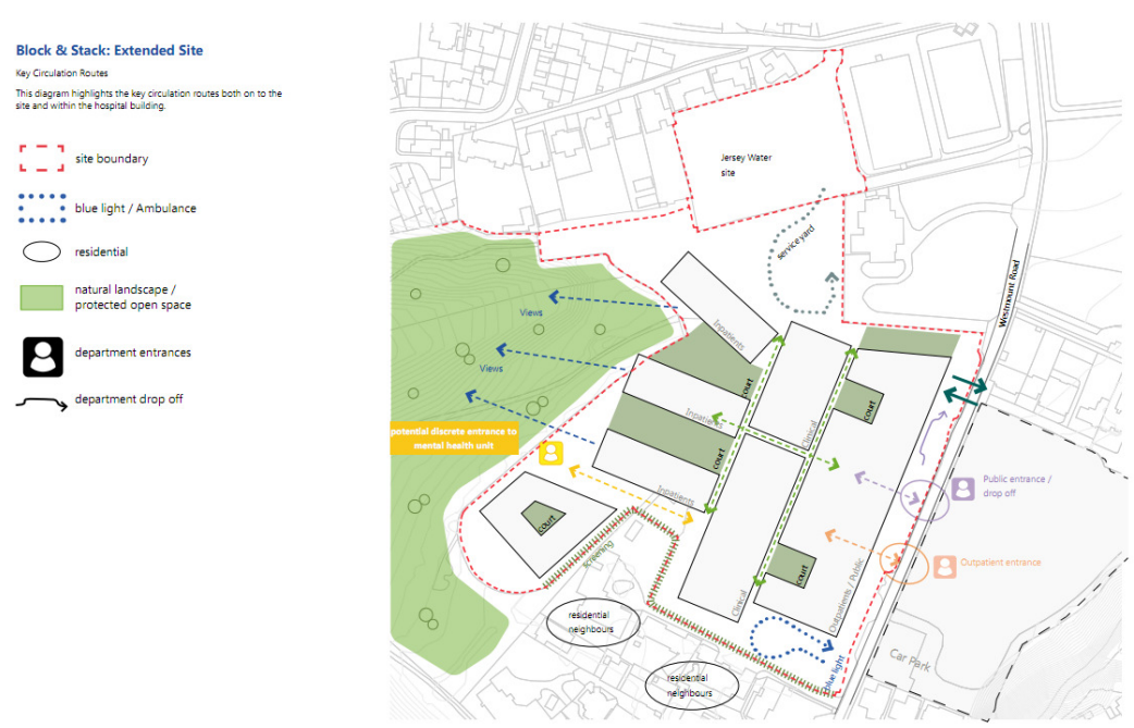
Extract 1.1: Conceptual Masterplan for Overdale Site